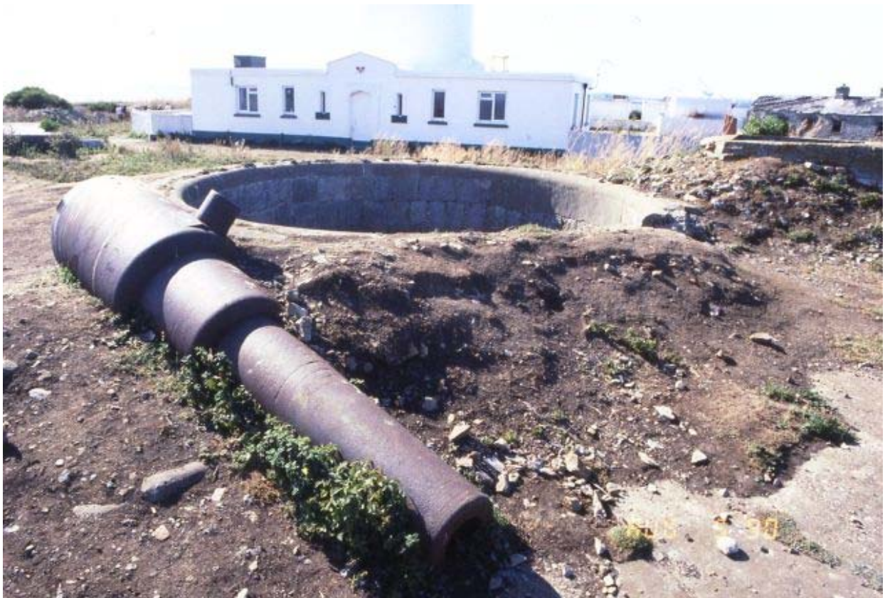
Light House Battery